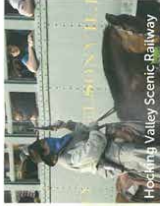
Hocking Valley Scenic Railway