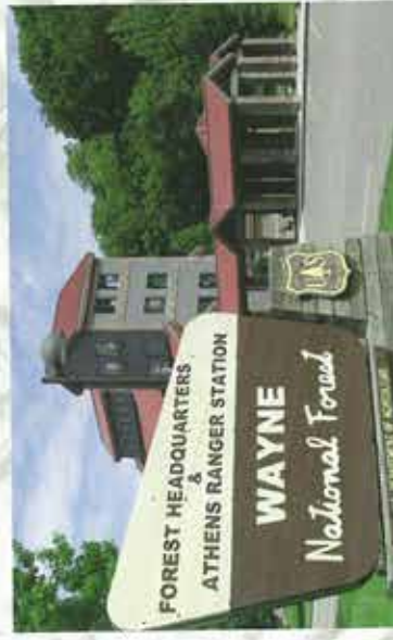
Wayne National Forest