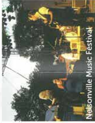
Nelsonville Music Festival