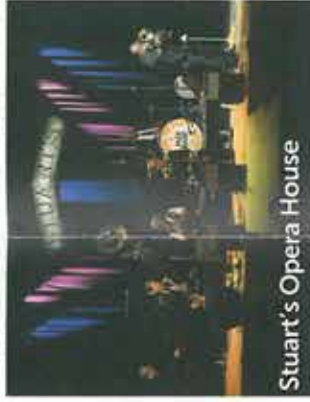
Stuart's Opera House