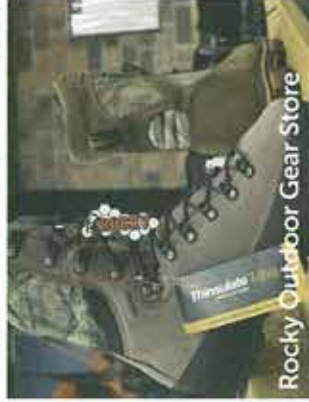
Rocky Outdoor Gear Store