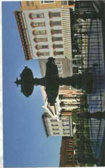
Nelsonville's Historic Public Square

Nelsonville was settled in 1814; a classic Appalachian town relying on coal, clay and salt. It was an early birthplace of the American Labor Movement. By the mid-1900s, Nelsonville was known worldwide for the Nelsonville Block and Starbrick bricks. Considered the most impervious bricks in America, they still line the sidewalks of Nelsonville's Historic Public Square.